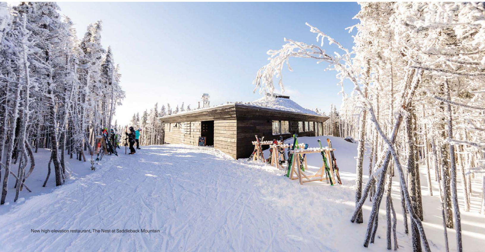
New high-elevation restaurant, The Nest at Saddleback Mountain