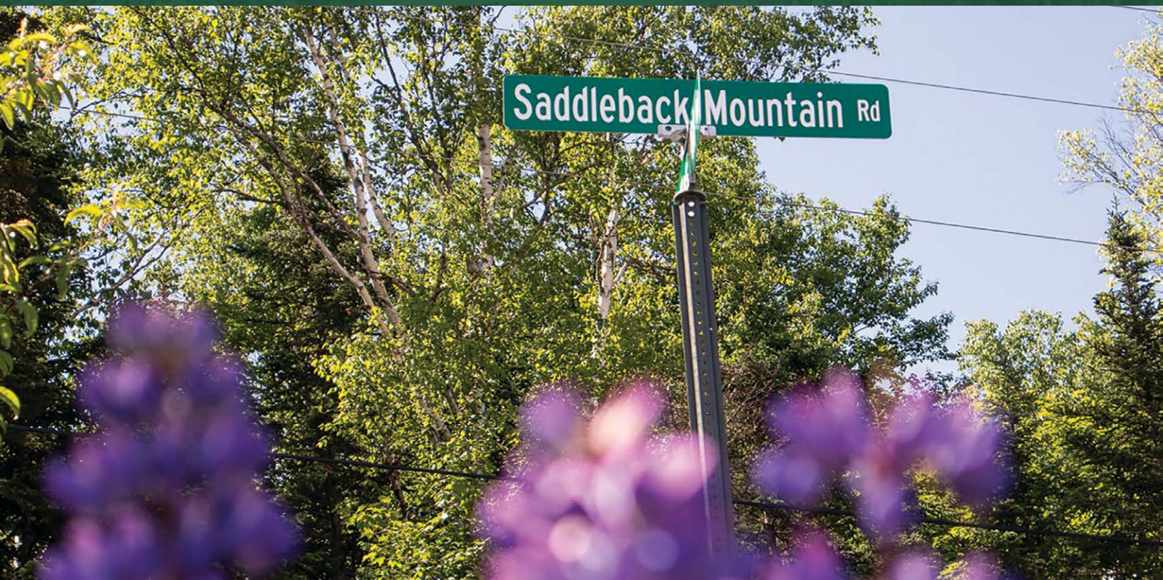
Photos by Andy Gagne. Photography with the exception of pg. 7, middle photo.